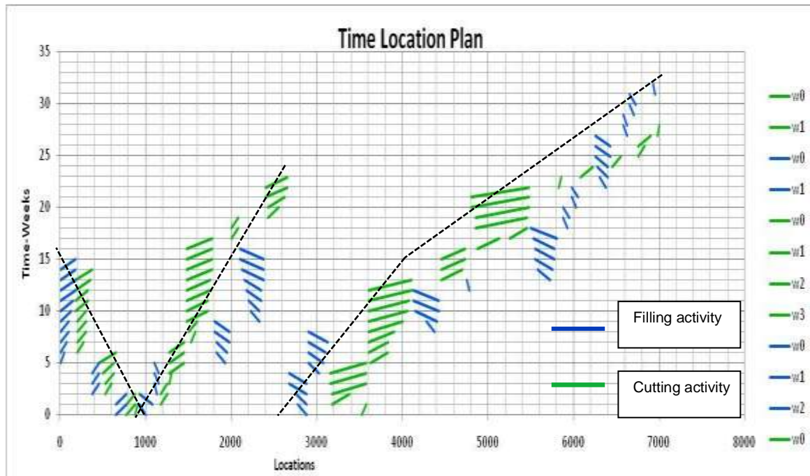
Fig 3: The model-generated time-location plan of a 7 km road project

both the model generated time-location plan in colour lines